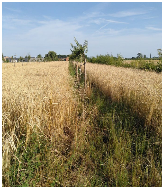
3. Pomona agroforestry field experiment following an agro-ecological way of crop production. Crop: Triticum spelta . Trees: mix of nut and fruit producing trees. (ILVO) FYM = farm yard manure, GS= grass silage. (ILVO)